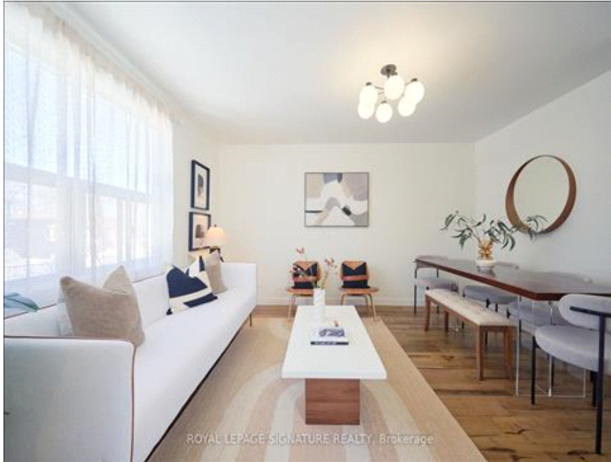
ROYAL LEPAGE SIGNATURE REALTY, Brokerage

The large primary suite and the second bedrooms face the backyard for peace and tranquility at night. The basement is completely redone with laminate flooring,